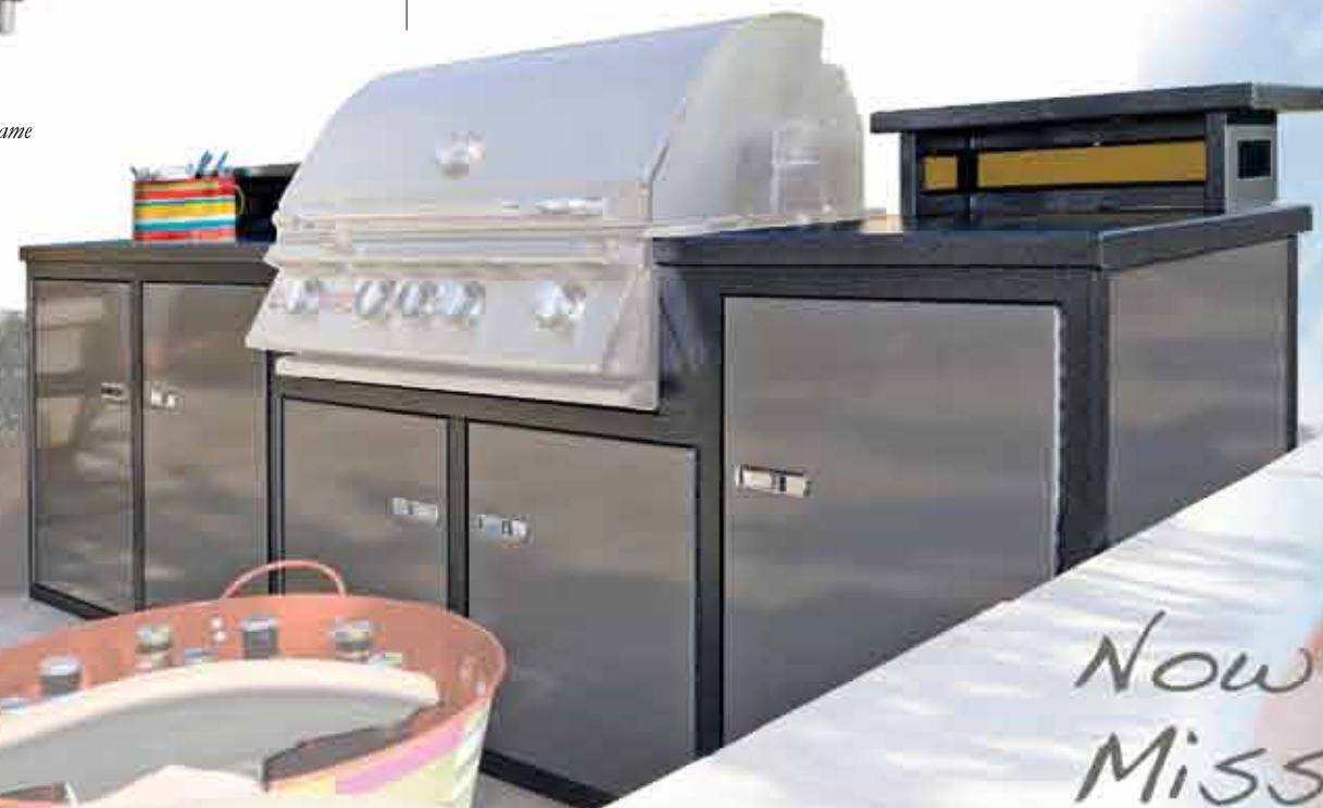
Shown with standard Silver Vein Frame and Metallic Pewter Panels