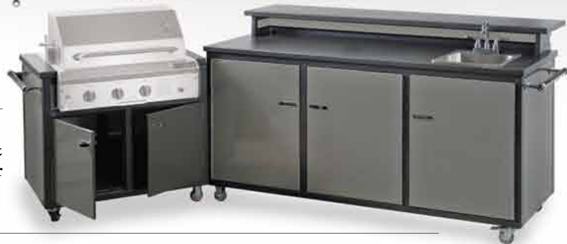
Grill Cart & Rolling Bar