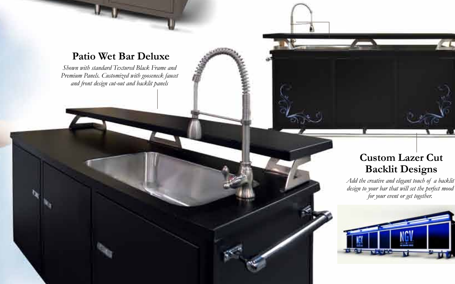
Shown with standard Textured Black Frame and Premium Panels. Customized with gooseneck faucet and front design cut-out and backlit panels