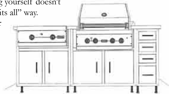
Custom built around your new or existing grill or stove top