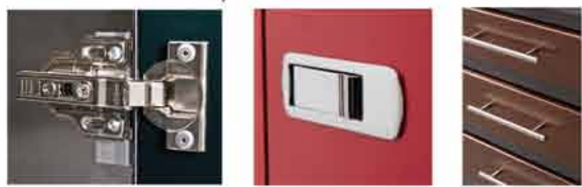
Quick Release Door Hinges Trigger Latch Custom Pulls