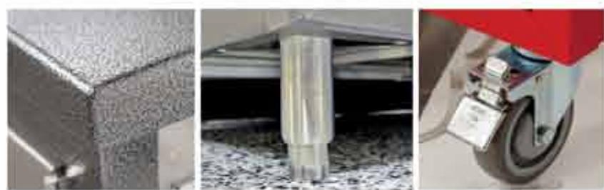
Powder Coat Finish Stainless Adjustable Legs Lock & Release Brakes

Counter Tops: Powder coat or optional brushed stainless steel finish