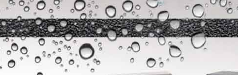
Shown with standard Silver Vein Frame and Metallic Pewter Panels