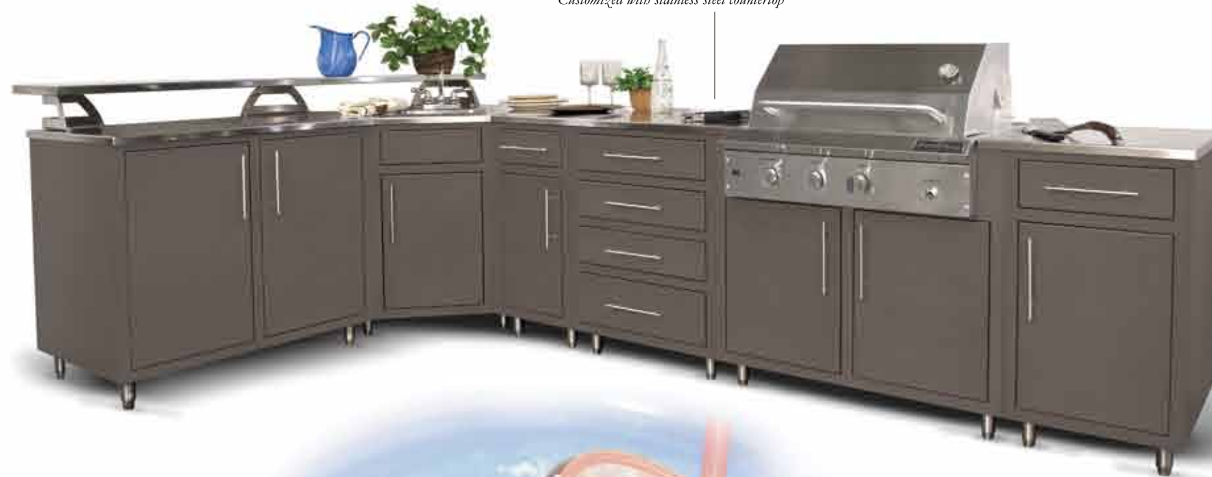
Shown with standard Mocha Frame and Premium Panels. Customized with stainless steel countertop