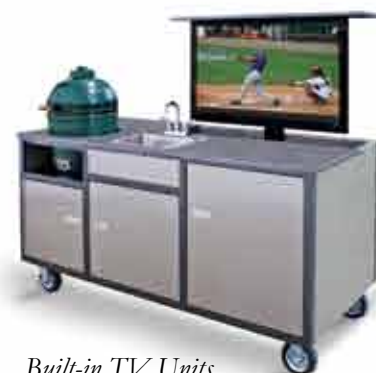
Built-in TV Units