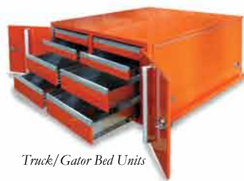
Truck/Gator Bed Units